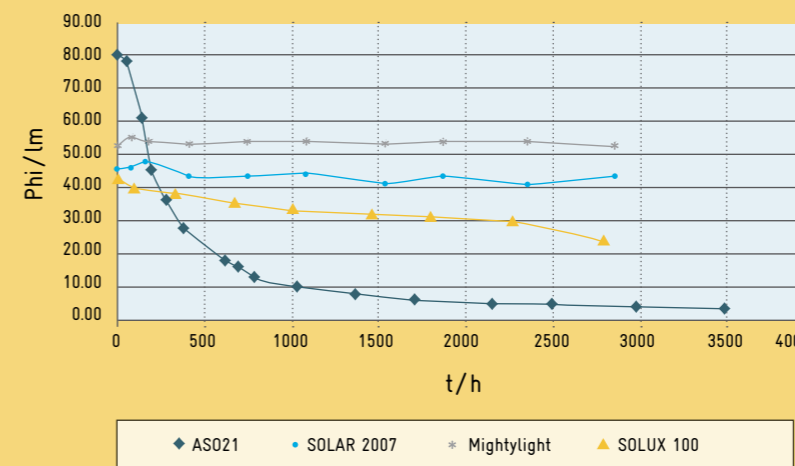
Graph 1: Degradation of the light output of poor low-power LEDs

Estimated unit costs of lighting from different sources, measured in kilolumenhours. Kerosene prices fluctuate widely. Lighting costs of better solar lanterns are currently roughly at par with kerosene lamps. Several solar lantern manufacturers have announced significant price reductions for 2009.